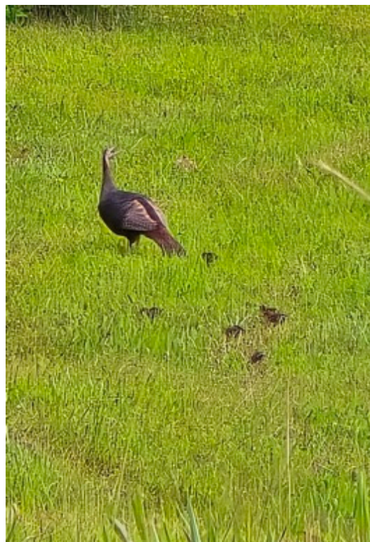
Mama turkey had a hard time hiding in this short grass, but her babies didn't!

ball of baby turkey appears behind her. And then another, and another, until seven baby turkeys follow mom across shorn field, across gravel road, into the woods. We stay a careful distance away, but still alarm her. Back she comes, across the road, into the field, dragging her wings and clucking to attract our attention. She lures us away from her babies and we obligingly follow, until she's far from her brood. Now we are alarmed. Her chicks are unprotected, peeping frantically for their mother. We turn back their way; the hen crosses back into the woods and hurries ahead to her young family. She's a good mama, and all is well. ~K