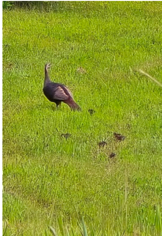
Mama turkey had a hard time hiding in this short grass, but her babies didn't!

ball of baby turkey appears behind her. And then another, and another, until seven baby turkeys follow mom across shorn field, across gravel road, into the woods. We stay a careful distance away, but still alarm her. Back she comes, across the road, into the field, dragging her wings and clucking to attract our attention. She lures us away from her babies and we obligingly follow, until she's far from her brood. Now we are alarmed. Her chicks are unprotected, peeping frantically for their mother. We turn back their way; the hen crosses back into the woods and hurries ahead to her young family. She's a good mama, and all is well. ~K