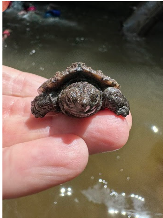
This reptile youngster might well have been discovering humans for the very first time!

From dragonflies flashing above the water, to crayfish and turtles underneath, explore the diversity of animals in this watery space.