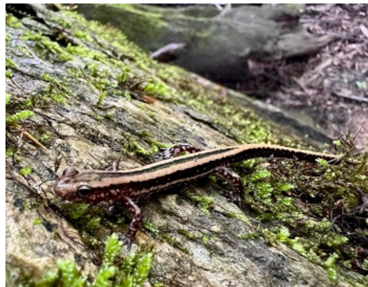
Slow down. Look closer. There's so much to see!