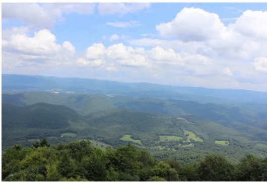
Bald Knob Overlook