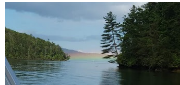
Rainbow in the mist