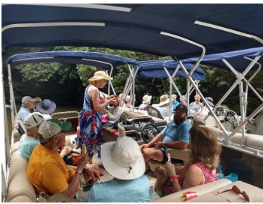
Birthday celebration with great friends, good food and beautiful scenery

Jocassee. Warmer days mean water temps are rising, too, making swimming a very "refreshing" experience (translation: still chilly in the shade.) From early morning to late evening, you can't go wrong spending some time out here. Leave your boat at home, let us do the driving and come... make some new memories. ~Sheryl White, JLT Naturalist guide