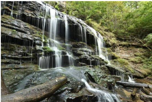
Station Cove Falls at OSSHS

Originally a military compound and later a trading post, this Historic Site offers both, recreational opportunities and a unique look at 18th and 19th century South Carolina.