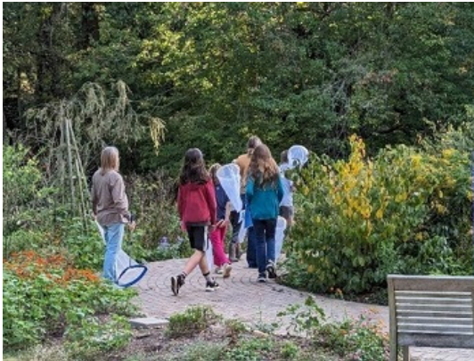
Junior Naturalists at SCBG

We'll discover how plants and animals adapt to their environments and how those environments are changing over time. (12-16 years old).