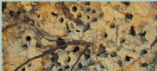
Potter wasps can build without blueprints, but they still get the occasional inspection.