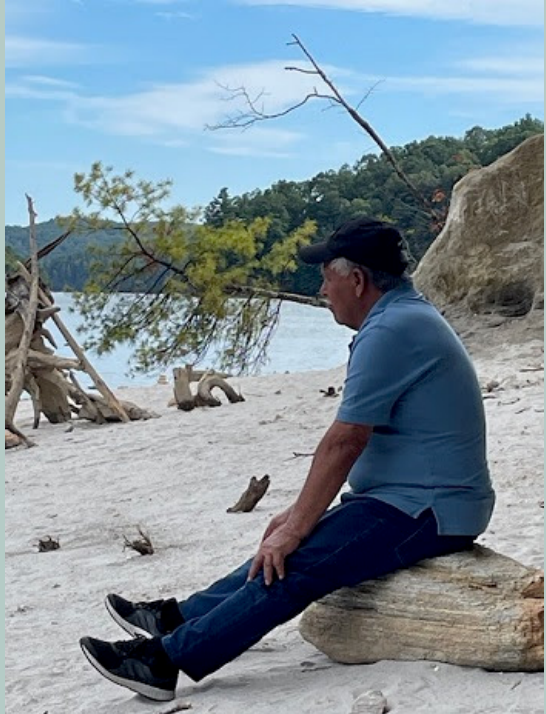
Chillin' & watching the family play, Photo by Debra Girard