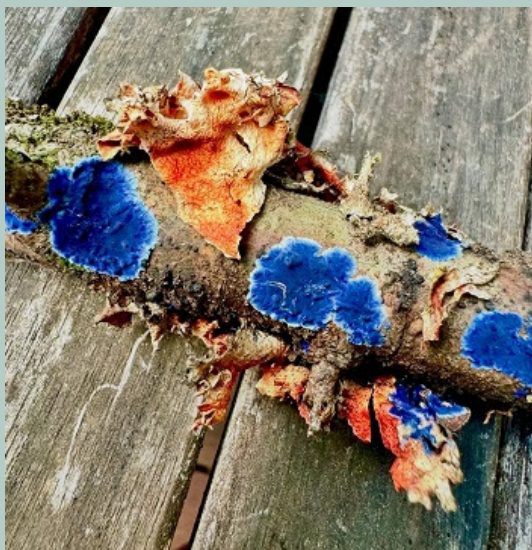
Terana caerulea Cobalt crust

Tours of MM includes an introduction to fungal ecology and life cycles, laboratory overview, tour of the greenhouse fruiting room, and if there is anything fruiting on the trail, you will get to experience it.