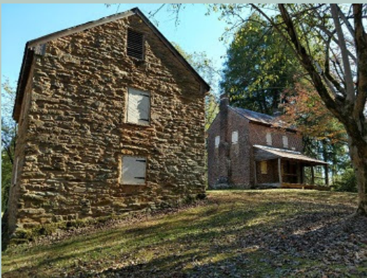
OSSHS was established in 1792

Originally a military compound and later a trading post, this Historic Site offers both, recreational opportunities and a unique look at 18th and 19th century South Carolina.