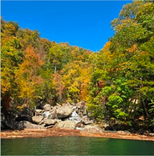
Whitewater River, 10.24.24