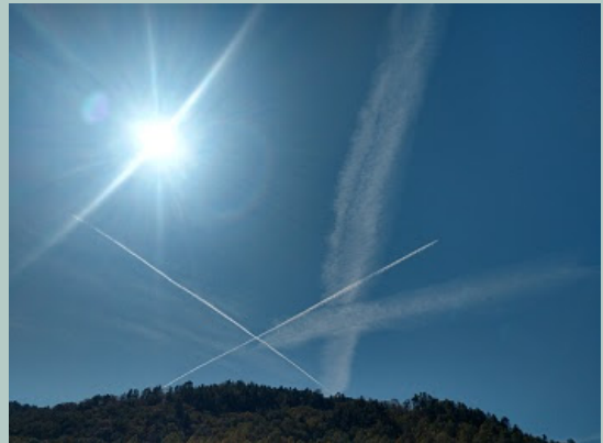
Busy skies over Jocassee 10.25.24