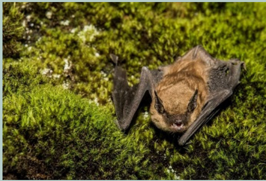
Eptesicus fuscus Big brown bat Celebrate International Bat Week!

November 18 & 21: 2:00-3:30 PM MM Farm Tour