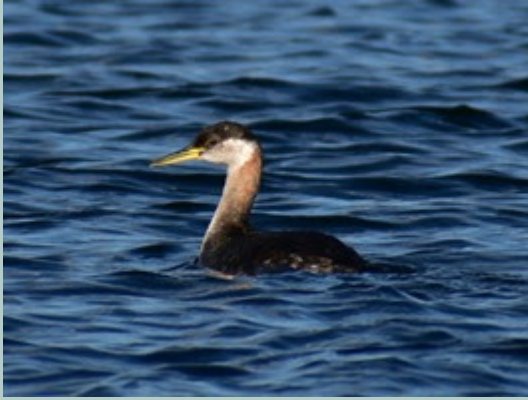
Red-necked grebe Lake Jocassee, Nov. 15, 2024