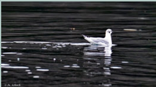
Bonaparte's gull, Lake Jocassee

CALL OR BOOK ONLINE TO RESERVE SEATS www.jocassee-lake-tours.com (864) 280-5501