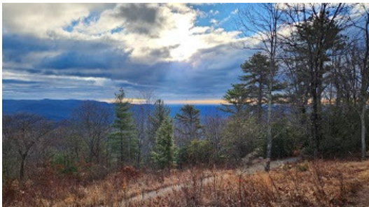
Gorges State Park