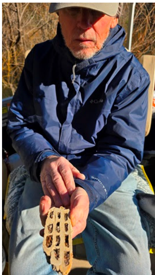
Brooks shows off the backside/inside of a dirt dauber's nest.

to set up her own household. She chews mud like old Aunt Sally chewed her tobacco, spitting out mud strips to pack on one side, then the other, to create a series of hollow tubes a little more than half an inch wide, four or five inches long, with several chambers contained within. She'll stop working long enough to mate. After every inch or so of mud tube construction, she'll lay one fertile egg inside. Now, she'll hunt spiders. She'll sting, paralyze, and stuff living spiders—lots of spiders--inside the chamber for her offspring to feed on as they grow. When not another spider will fit in that section of chamber, she seals it closed with more spit and mud, mates again, and begins the whole process again. If she builds her masterpiece on a wood duck box on Lake Jocassee, it'll be gone next winter with one swipe of a scrape blade. Female mud daubers are said to sing as they work. This summer, let's listen for them. ~K