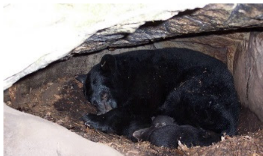
Black bear, mother and cubs

OUTDOOR EVENTS THIS WEEK, JANUARY 20, 2025