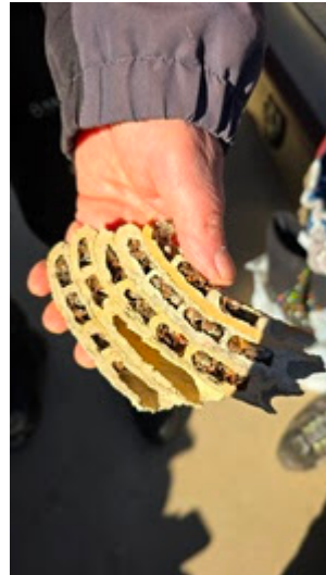
...this one has a little flair! Both are packed with spiders!