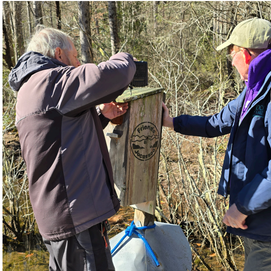
Friends of Jocassee clean and repair wood duck boxes around Lake Jocassee in preparation for the coming breeding season.

Follow Jocassee Wild Child Adventures on Facebook! https://www.facebook.com/jocasseewild