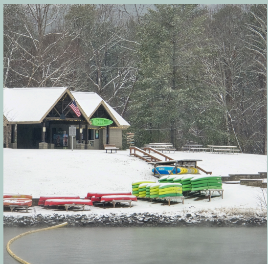
Our friends at Eclectic Sun will reopen the first of March, and their