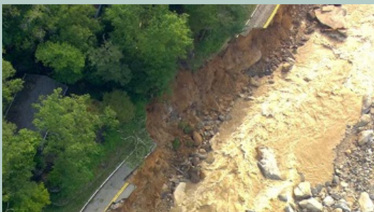
Helene storm damage in Chimney Rock area. September 27, 2024

Most State Parks in western North Carolina have reopened, at least partially. Chimney Rock, Mount Mitchell, and South Mountains are closed long-term until further notice. Check each Park's pages for the most up-to-date status of facilities! ncparks.gov