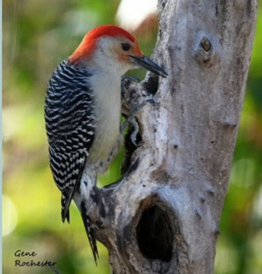
Red-bellied woodpecker, Photo by Gene Rochester