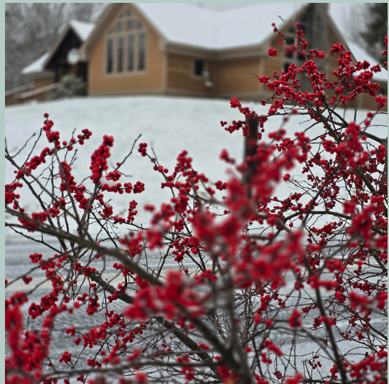
Winterberry holly is a cheerful addition to the DFSP landscape