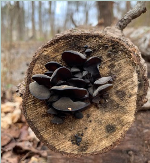
Wood ears fungi

This tour is perfect for anyone interested in learning about growing or cooking their own mushrooms, foraging for wild mushrooms, caring for our environment with mushrooms, or even starting their own mushroom farm.