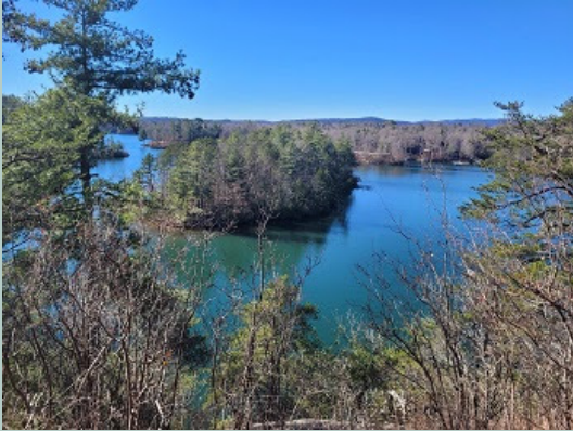
Keowee/Toxaway SP

Join us for a moderate 4.2 mile hike along a beautiful nature trail that includes a very nice overlook of Lake Keowee and a small hidden waterfall.