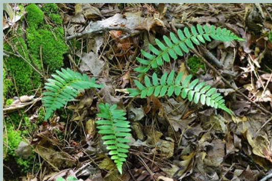
Christmas fern

Come identify some of our most common evergreens and learn about the adaptations that make them suited for the winter season.