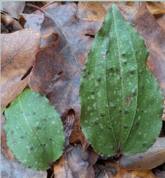
Tipularia discolor Crane fly Orchid

THANK YOU for your continuing support of Jocassee Wild Child!