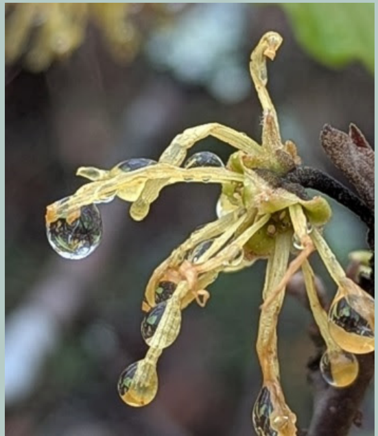
Fading, moisture-laden petals of witch hazel,