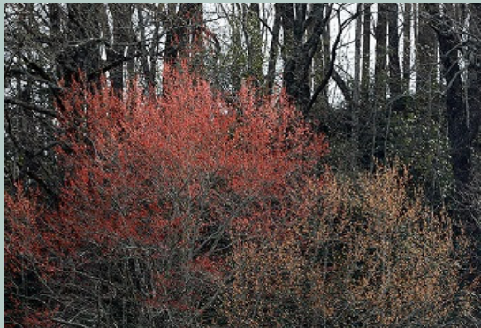
Acer rubrum Red maples in flower, Female (red) and Male (gold), Photo by Pam Barbour