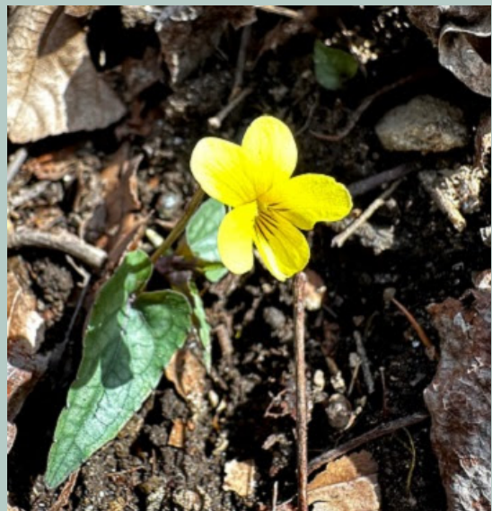
Viola hastata Halberd leaf violet