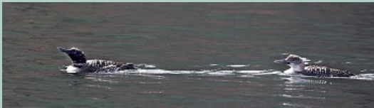
Adult loons at various stages of molt.