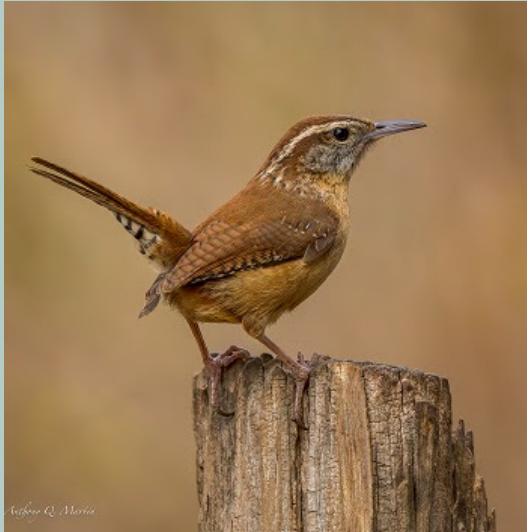
Carolina wren

the old Conestee Mill and Dam to bird a section of the paved trail.