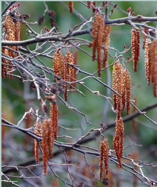
Male catkins on Alnus serrulata smooth alder