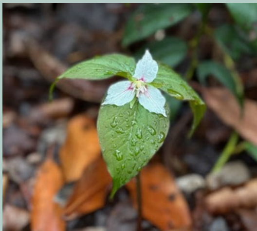
Trillium undulatum Painted trillium

This hike will begin at Burrell's Ford, hiking to King Creek Falls and then Spoonauger Falls. It will then take the connector up to the Foothills Trail and return to Burrell's Ford.