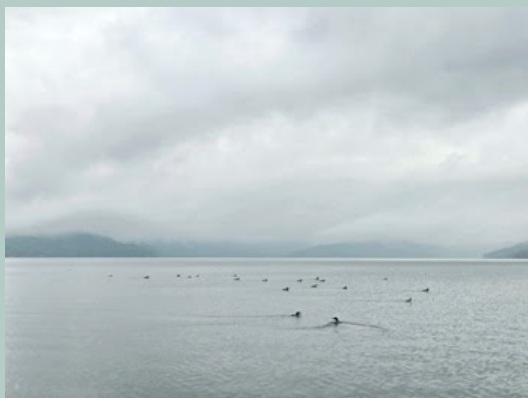
An asylum of loons leaving soon.