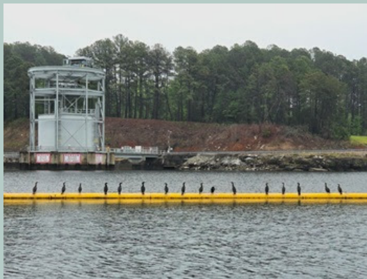
A gulp of double-crested cormorants sitting on the buoy.