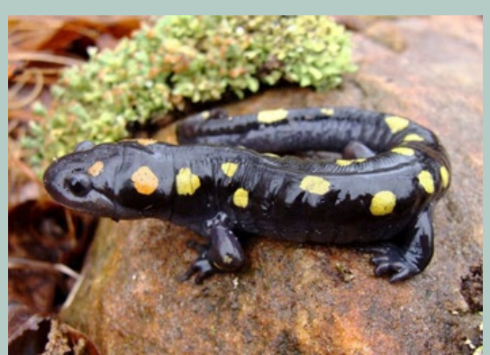
Ambystoma maculatum spotted salamander

Children will go on a walk to see what reptiles and amphibians we can find out on our trails and do a Challenge towards earning an ecoEXPLORE Herpetology patch!