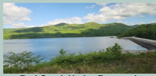
Bad Creek Hydro Reservoir