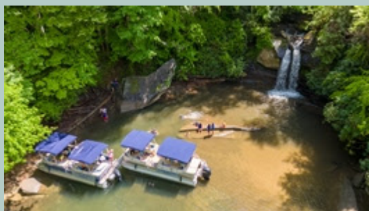
Fun fun fun at Wright Creek Falls!