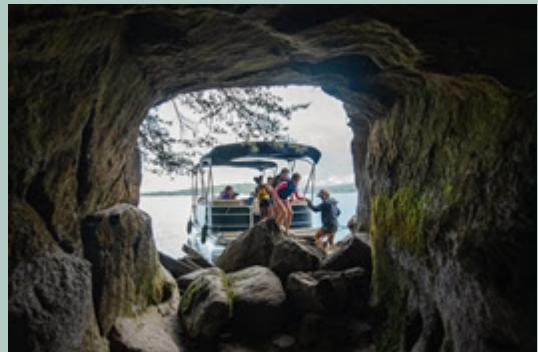
Exploring the Otter Cave!

They spill from big yellow school buses with giggles and nervous anticipation, these wild children. For today, they leave behind indoor classrooms. Out here, in the Jocassee Gorges, they will enter their natural habitat, the one that has nourished and sustained humanity for thousands of years. There are no walls. Out here, their