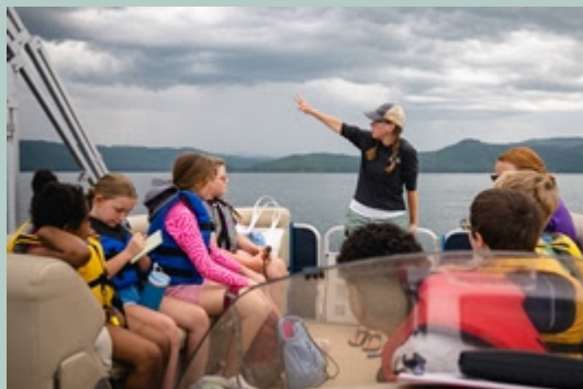
Learning about weather and rainforests, while experiencing weather and rainforests!