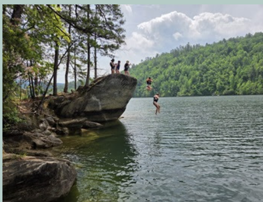
The perfect jumping rock is hard to resist.

Discover seasonal highlights and get up close and personal with the native plants and plant communities that support biodiversity in real time.