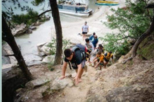
Give a kid a chance to climb...

When they return to the dock at the end of their adventure, these young people are making ancient music with drums and rattles; they