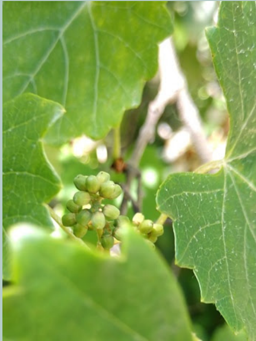
Vitis rotundifolia , young muscadine grapes