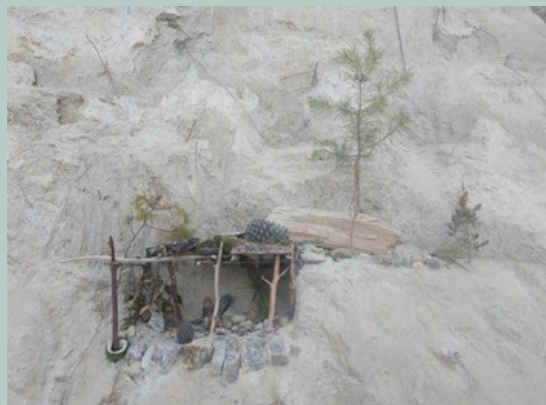
Jocassee's latest vacation home, located at Tahiti beach, waterfront, spectacular views, newly landscaped, turnkey....builder unknown.