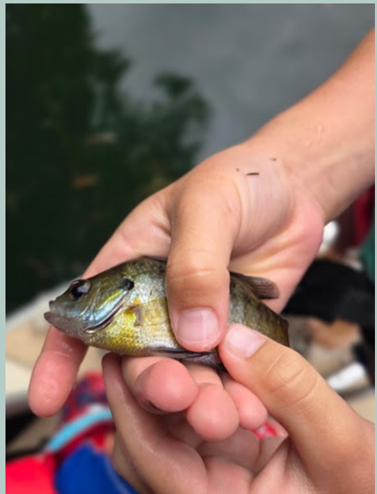
Her patience paid off!

Current conditions at Lake Jocassee via Devils Fork State