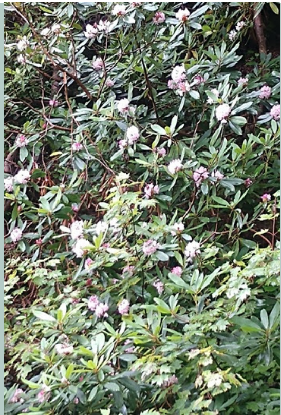
Rhododendron maximum, large-leaf rhododendron