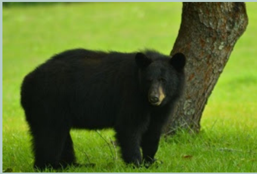
Ursus americanus American black bear