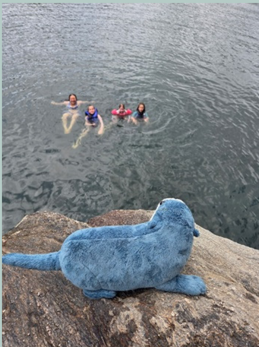
Jocassee Adventure Campers,