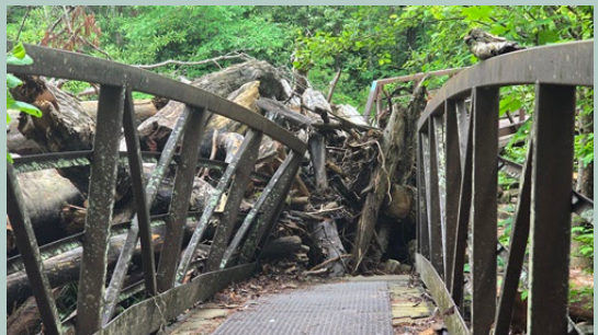
Don't let this stop you. There is a way over the Whitewater River.