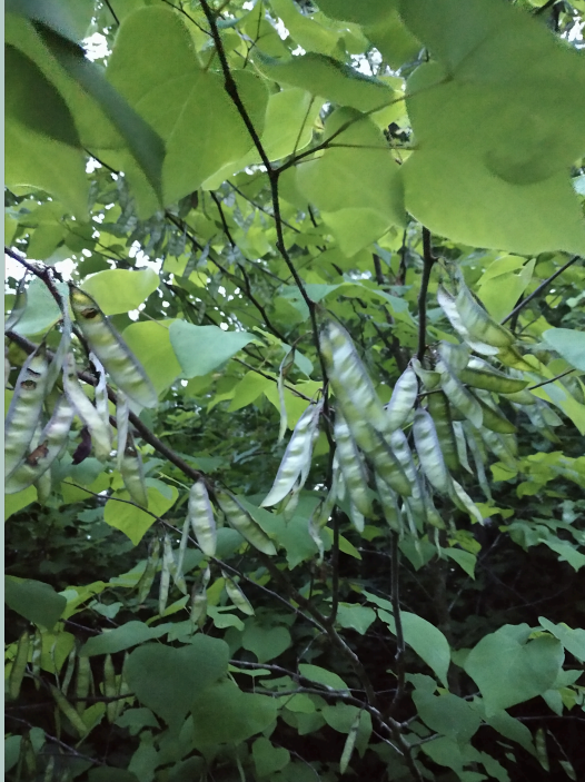
Cercis canadensis Redbud seed-pods