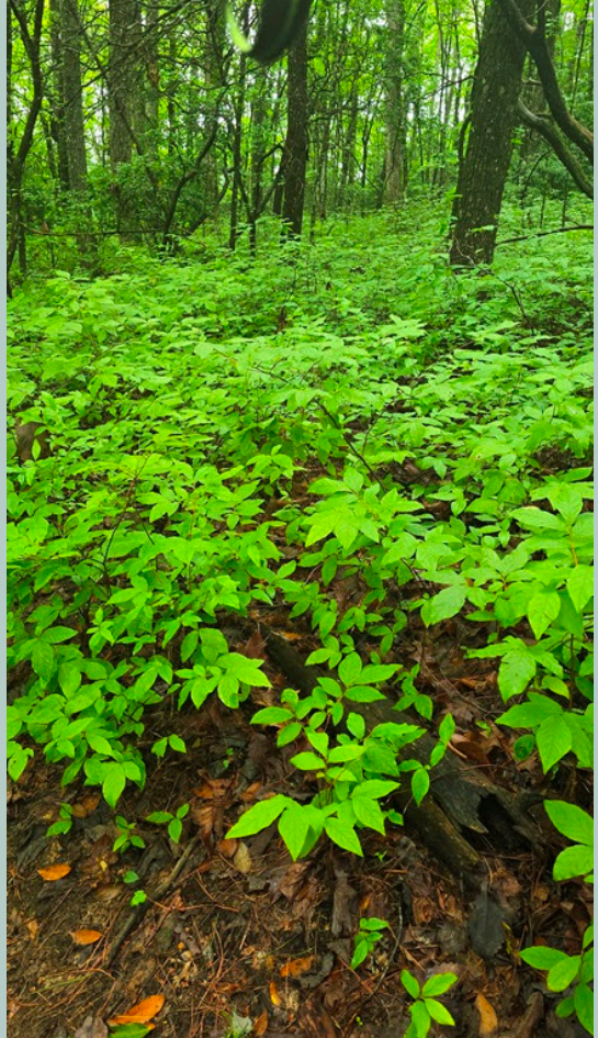
On the way to Coon Branch Trail

A short spot of old growth forest on the west side of the Whitewater River was preserved from the sharp teeth of chainsaws. The story of its saving is worthy of more than a paragraph. It is our destination on this beautiful Saturday in mid-June, serenaded by two Swainson's Warblers and a Red-eyed Vireo as we enter shady woods. Down by the Whitewater bridge, a logjam of river-washed elder trees, compliments of Hurricane Helene, makes the passage to the Foothills Trail appear all but impossible. (It's passable.) The entry to Coon Branch Trail at the same location appears impassible, but humans, not to be denied, have worked around the debris, though the trail itself grows narrow from lack of use. A limb the width of my shoe, skewered into the middle of the path, reminds us of widow-makers in the canopy. Snails and mushrooms and ferns and mosses and huge trees and creek crossings capture the attention; not until we turn to return do I notice the poison ivy we've walked through. So much for total awareness.~K