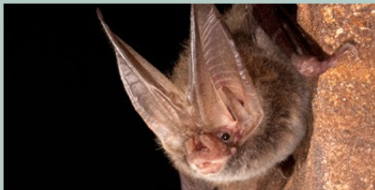
Rafinesque's big-eared bat

Join our Naturalists on a walk through the Garden to tune into the sounds of the many special bats of the Highlands area and watch them in flight.