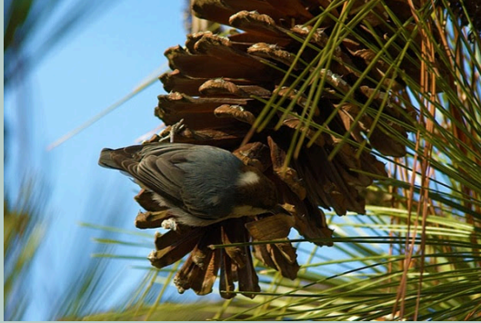
Brown-headed nuthatch

Join a park naturalist to learn about the birds that call GSP home. Then, create your own pinecone bird feeder to take home and help support your backyard birds. Everyone is welcome!