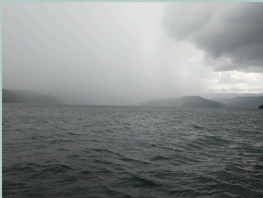
Rain moving across the lake.