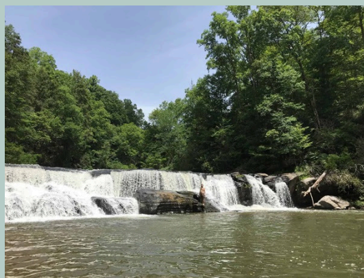
Riley Moore Falls,

This is a popular trail for birding, hiking and walking. The drop of the Falls is only 12 feet, but it has an almost 100-foot span across the river with a swimming hole at its base.