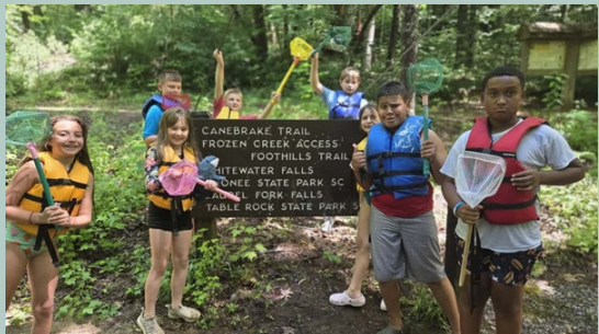
Future Foothills Trail Hikers