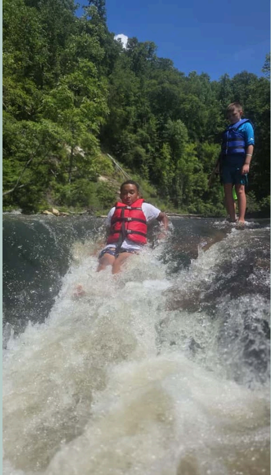
Cradled in a mossy rock chair, chillin' in the Toxaway River.