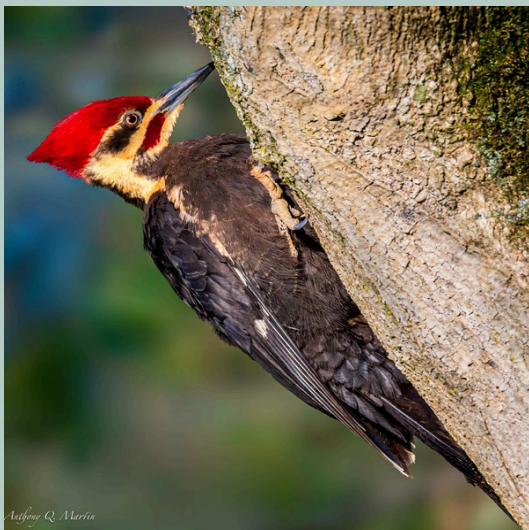
Pileated woodpecker at CNP

Longer walk- Meet behind the baseball stadium to bird a variety of paved and natural surface trails in the Preserve. Shorter walk- Meet at the Spanco Drive parking area next to the old Conestee Mill and Dam to bird a section of the paved trail.