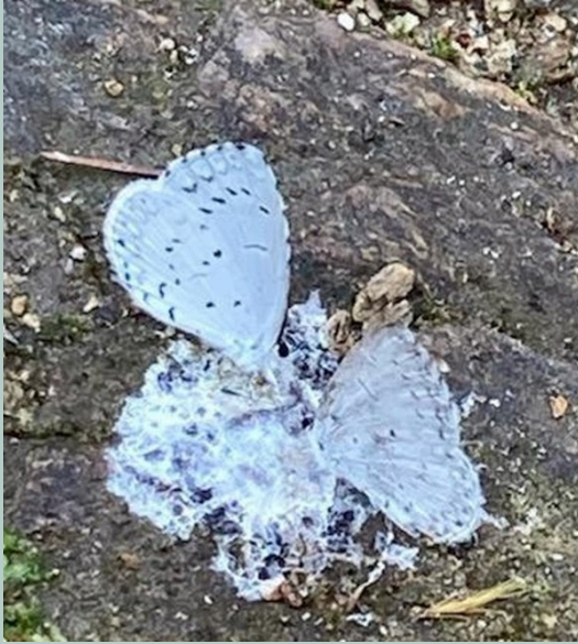
Celestrina neglecta at a puddle party.

misidentified as spring azure. These butterflies are not picky eaters and young caterpillars enjoy dogwood trees, New Jersey tea, and other plants. Summer azures produce more than one brood annually. The first brood of the summer azure emerges even before the spring azure's first brood. These butterflies fly later in the summer. BINGO! Sounds like this is the one we are seeing. It's amazing to me that these three butterflies that look so similar have their own unique differences. There is so much to learn out in the wild areas of Jocassee. ~Cam McDade, JLT guide.