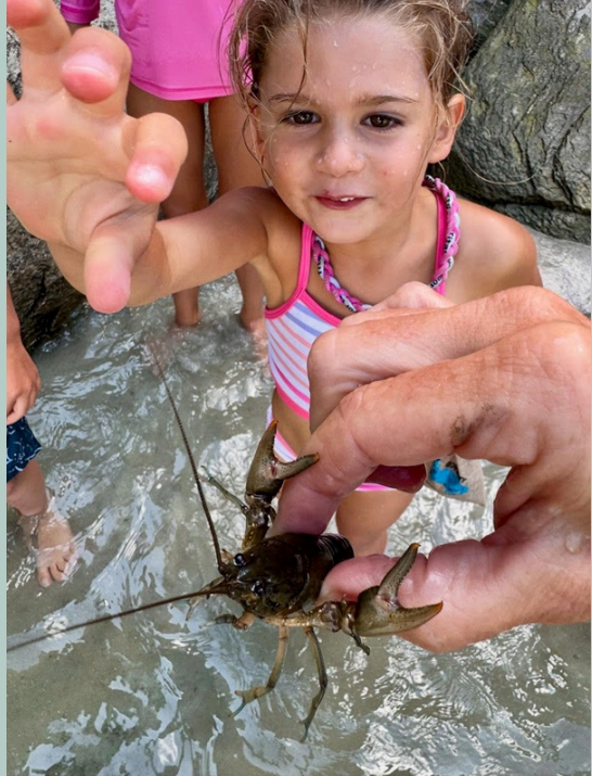
Watch those little crayfish claws!