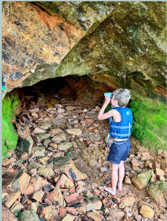
Searching for water bears...