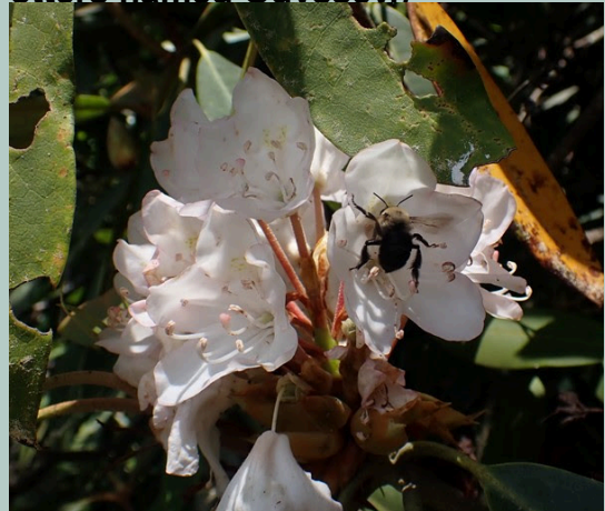
Bee volunteers on Earth as a flower pollinator. (Pictured here: Bee on Rhododendron maximum)

(Just keep in mind, Bee, that you have traveled many light years from home to study human beings in the Milky Way, not blue river otters named Odyssey.)