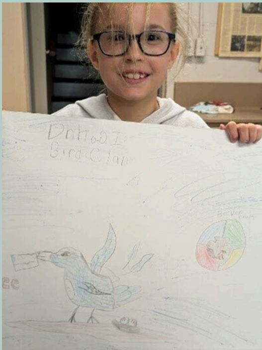
Bird clan of the Cherokee