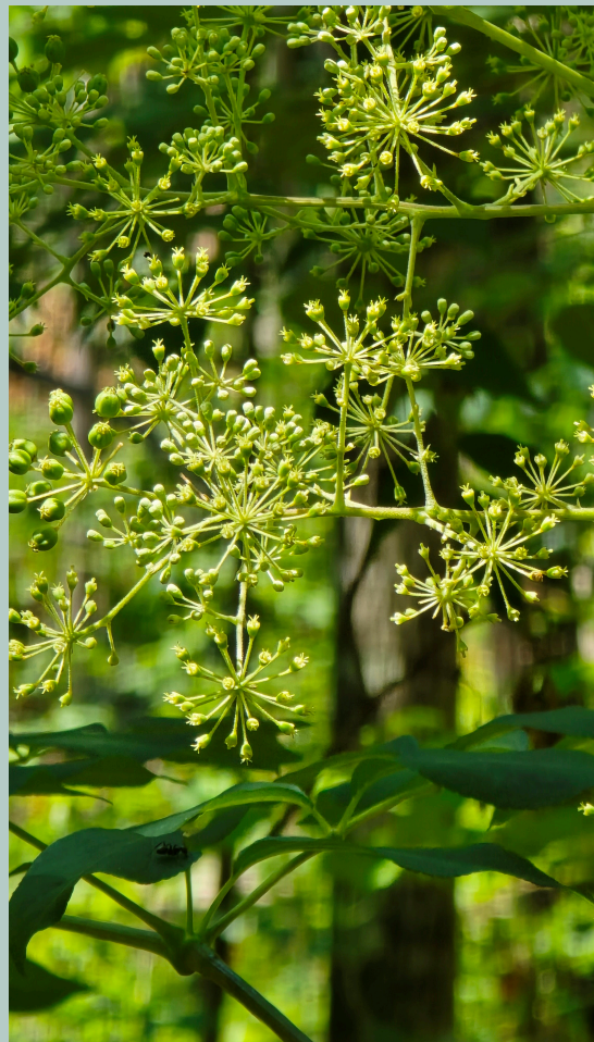
It's Devils Walkingstick season!