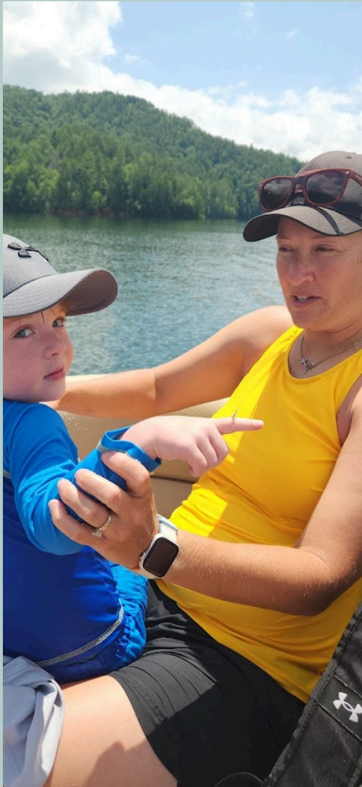
Summer azure hitching a ride.