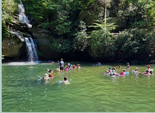
A few of the people enjoying Wright Creek Falls on Saturday.

trying not to transpire. Even the cicadas are quiet in this heat. Humans, though, we humans leave air-conditioned homes to jump in air-conditioned cars and head to Lake Jocassee, seeking the sweet relief of cooling water.