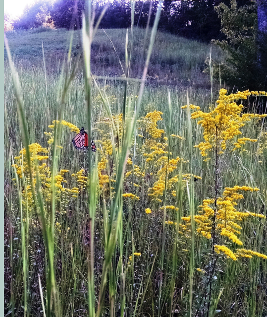
Solidago species a.k.a. goldenrod, with pollinators galore!

worthy of the wait. We (or our paid gardeners) discard goldenrod to make room for more favored species: Black-eyed Susans and purple coneflowers, which are, by now, quite finished, bloom-wise. But goldenrod, that tough native often considered too “common” for our pampered, high-dollar perennial gardens, takes quiet revenge by casting its golden spell against the edge of every sun-soaked country road. ~K