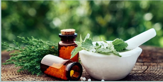
Hagood Mill Photo

Join UF staff, BoD's, and supporters as we celebrate the past year's conservation successes at Elf Leaf Farm, a family-owned lavender farm