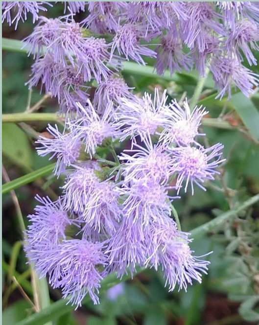
Conoclinium coelestinum Wild ageratum