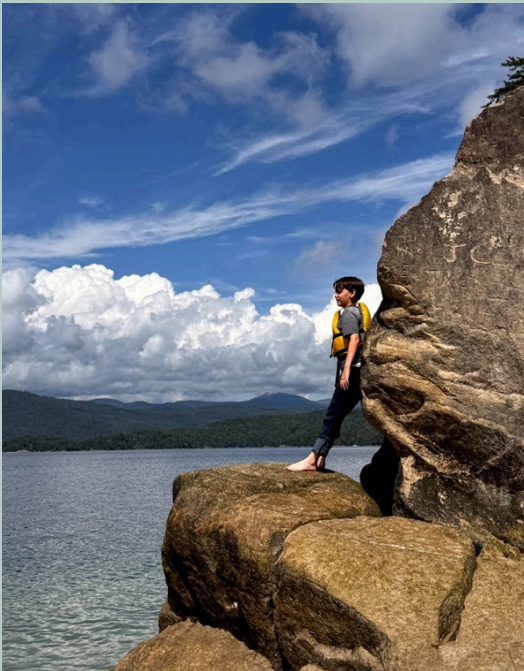
Sacred moments, Photo by Kerry McKenzie

Current conditions at Lake Jocassee via Devils Fork State Park Webcam Sponsored by Friends of Jocassee