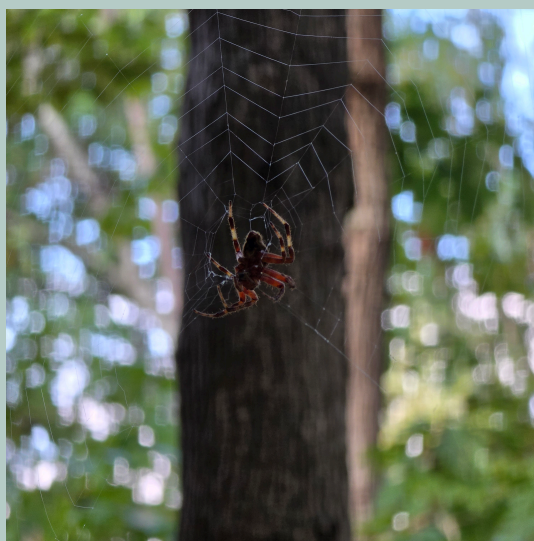
Harvey the orb-weaving spider. a.k.a. Araneus cavaticus a.k.a. Barn spider