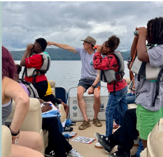
Support Jocassee Wild Child!