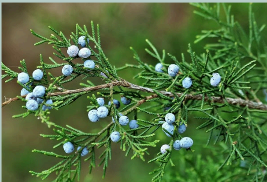
Juniperus virginiana, Eastern Red Cedar

The South Carolina Botanical Garden: A Living Story for Our Community