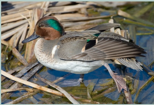
Anas carolinensis , Green-winged teal