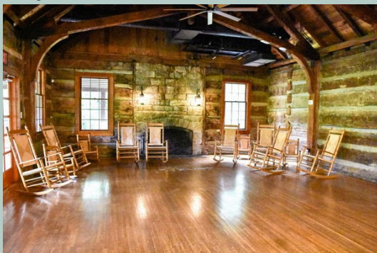
Table Rock Lodge,

Enjoy traditional Blue Grass music as local musicians gather at Table Rock to keep this inspirational talent alive.