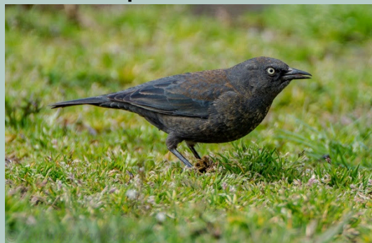
Euphagus carolinus Rusty Blackbird

The rare Rusty Blackbird will take center stage along with vultures, chickadees, and titmice. Binoculars provided.