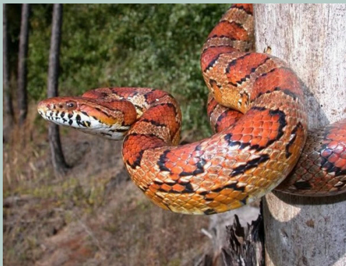
Non-venomous Corn snake

Alan Cameron will discuss the 18 non-venomous and two venomous species of snakes that inhabit Polk and Henderson Counties.