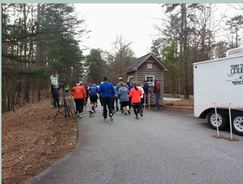
A past First Day, 5K Ranger Run at Devils Fork State Park, January 1, 2014