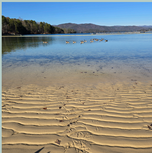
Winter. Geese have the lake to themselves.