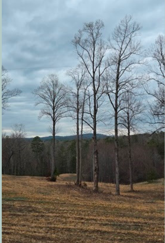
Tulip poplars play nice with the neighbors.

limbs thrust this way and that at wide, irregular intervals, all the while branching and branching and branching again to take as much sky-space as possible. And then there are those hippie sourwoods, arrow-straight in early years, with lithe trunk bending and swaying and curving as they age; yoga mama tricksters growing into near impossible poses. Who grows in your yard? ~K