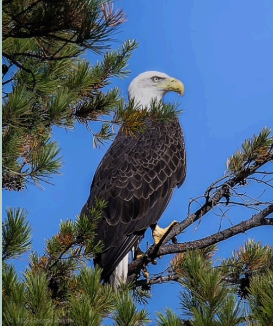
Bald eagle