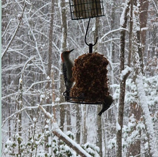
One little guy's hiding from that red-bellied woodpecker!