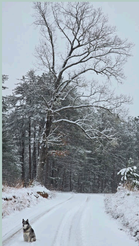
This weekend's snow.