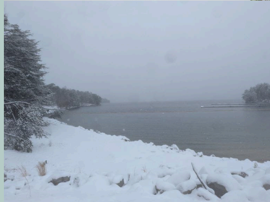
Lake Jocassee, photo courtesy of Friends of Jocassee