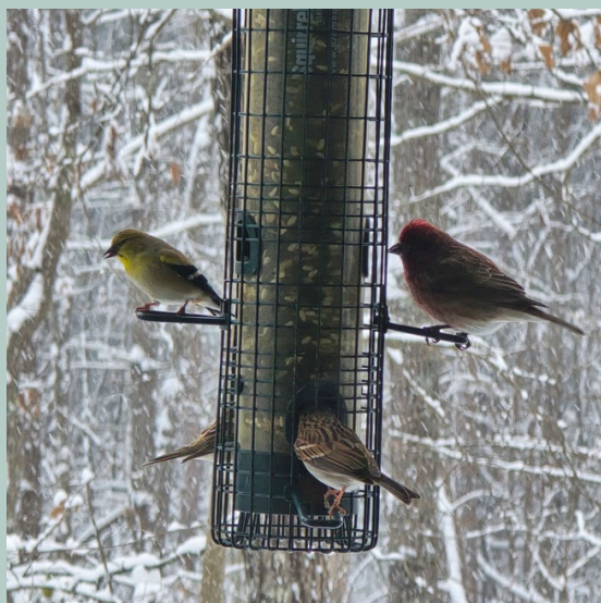
Everybody gets a turn. No pushing.

FOOTHILLS TRAIL HIKING SHUTTLES ARE ALWAYS AVAILABLE! CALL (864) 280-5501