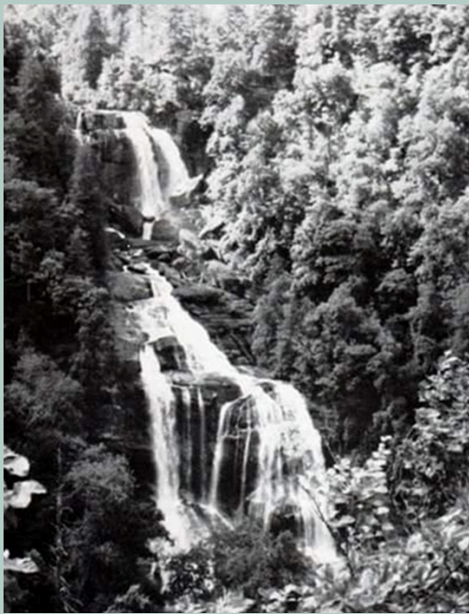
A section of the Whitewater River still flowing free.