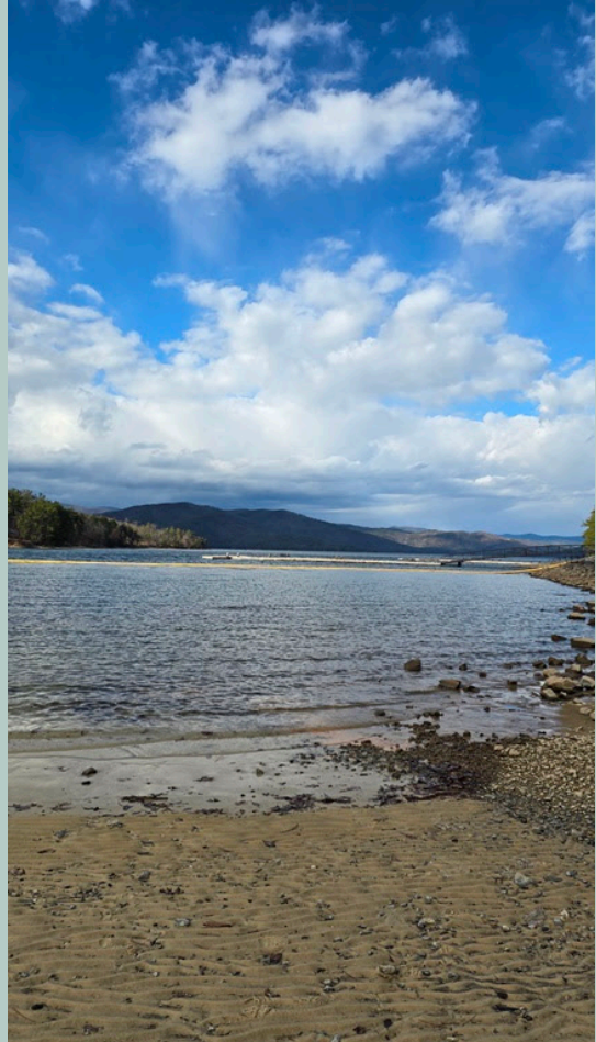
Water's low in Lake Jocassee.

before that seasonal urge becomes full-on fever, urging them north. On Lake Jocassee, Common Loons are flightless, molting soft downy feathers that blow across lake and gather against the floating barrier in front of Keowee-Toxaway intake towers. Small flocks of ducks—species unidentified—pass in the distance, flying low over rippled lake water. Change is in the air. ~K