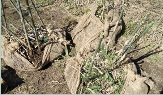
River cane starts, CC Photo

Torry Nergart, our Natural Resources manager, is seeking six volunteers to help plant river cane at Pleasant Grove.