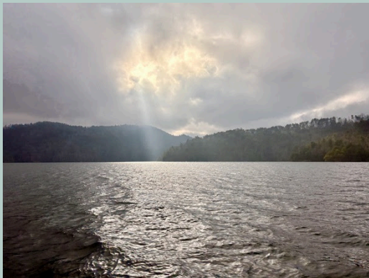
Sunlight streams through a break in the clouds on a Jocassee winter afternoon.

(Due to the recent winter weather, check your State Park Sites to make sure these events are still scheduled and each Park is open).