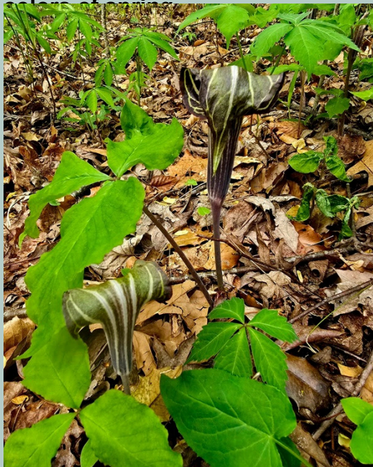
Arisaema triphyllum Jack-in-the-pulpit

Join us on a one mile walk and view trilliums, bloodroot, foamflowers and the vibrant colors of spring.