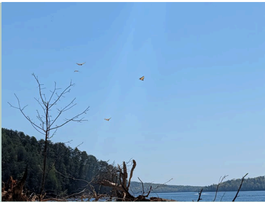
Multiple butterflies soaring over Lake Jocassee