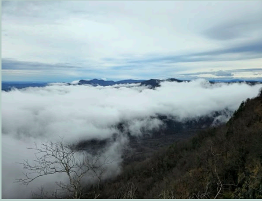
Photo taken from Caesars Head looking towards Table Rock

Step outside and celebrate Earth Day where nature and neighbors meet.