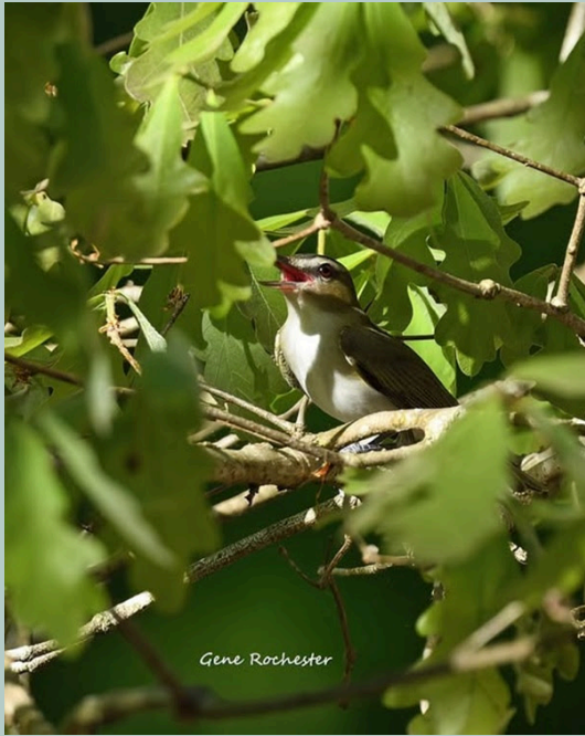
Red-eyed Vireo, Photo by Gene Rochester

in the heart of the Blue Ridge Mountains!