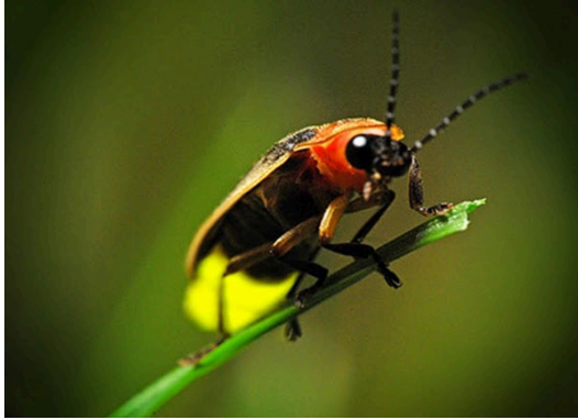
Firefly