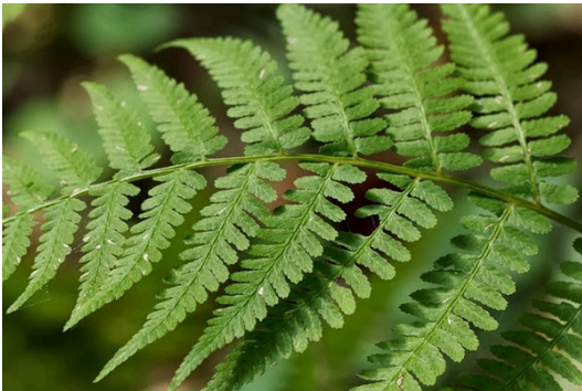
Athyrium filix-femina Lady fern