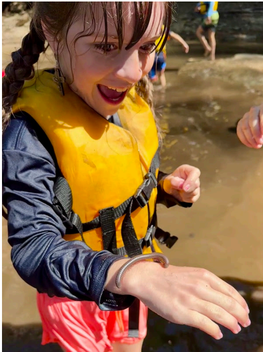
Tickle, the millipede, meets a Jocassee Wild Child

On the ground, I see a millipede. Our Wild Child group has been keeping track of all the species we see, so we examine this slow mover. It's sitting on a leaf, so I pick up the leaf and coax it into crawling on my hand. I explain that millipedes eat decaying leaves, that they have two pairs of legs on each body segment, and that they are among the oldest land animals. I'm explaining too much. What these fourth graders are going to remember is the feel of those little feet crawling on their skin. I mention that if they handle it roughly, it might excrete a yellow liquid on them. Ewww! I invite them to let it crawl across their hand. As it moves slowly from my hand to a fourth-grade hand, I hear the exclamation, "I can feel it crawling!" Then we notice that this little creature has a scar on its back. Did it narrowly escape predation? Who knows, but it reminded me that this millipede may not be the only one moving through here with scars. Handle with care. Good advice for all of us