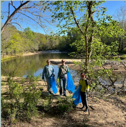
FoRR FB photo

Join us as we work to collect litter from various locations along the Reedy River.