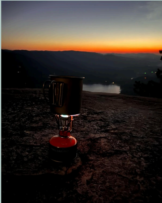
Early morning sunrise on Table Rock,

Be an extra early riser and take a unique moonlit hike up to the end of Table Rock Mountain.