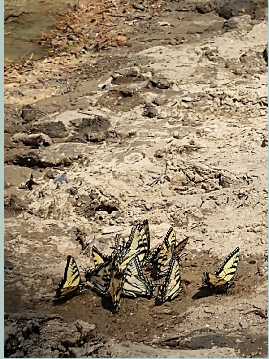
A kaleidoscope of Eastern tiger swallowtails, puddling