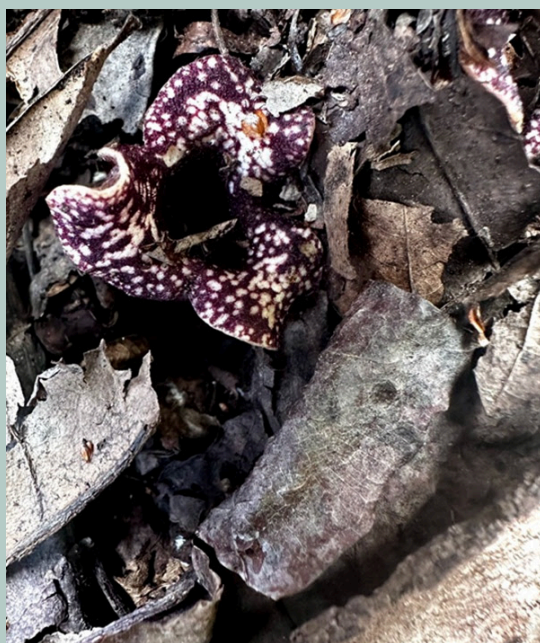
Hexastylis sp. Heartleaf