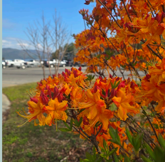
"Tallulah Sunrise" is a native-ish hybridized cultivar of our local native flame azalea.