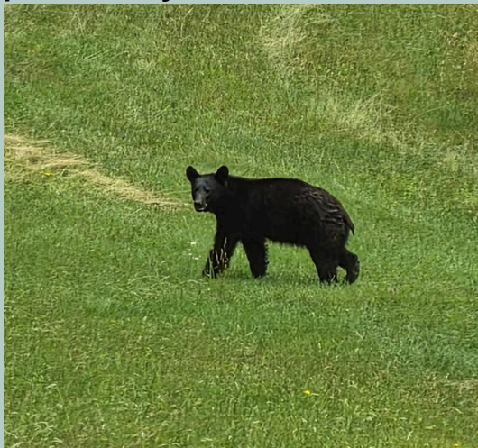
American black bear