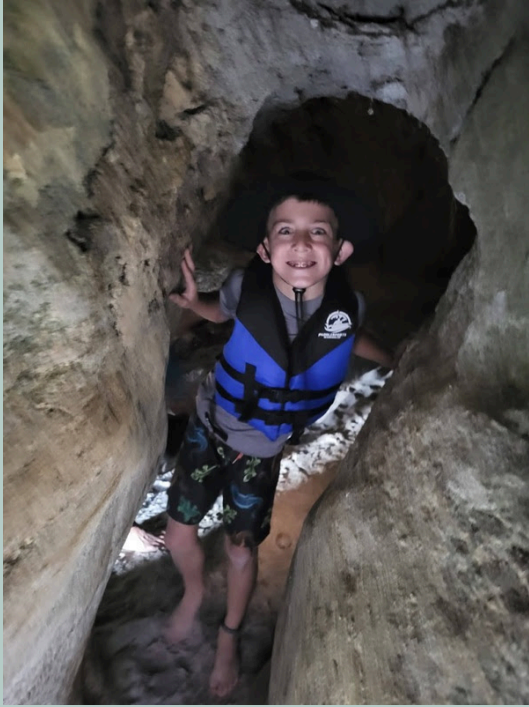
Exploring an Otter Cave