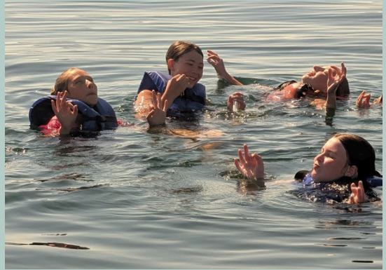
What a great way to end a school year!