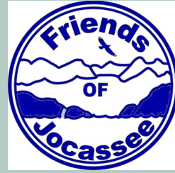
Lake Jocassee Webcam