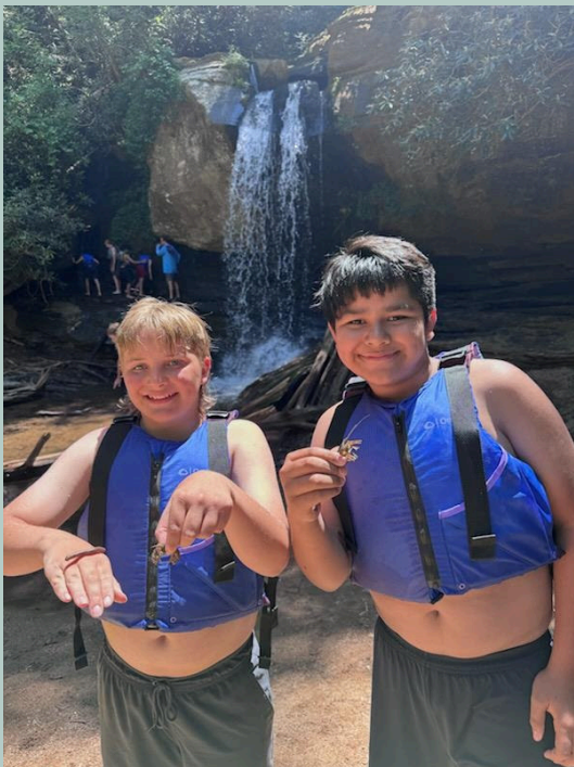
Jackpot... two crawdads and a millipede!