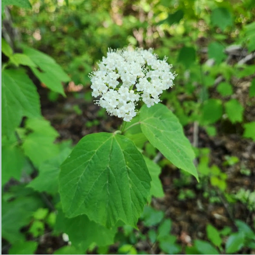
Viburnum acerifolium Mapleleaf viburnum