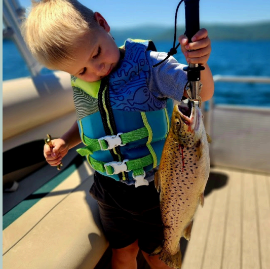
Starting 'em young.

and throws cloud shadows against the swell of mountains along the great Blue Wall. Morning melds into afternoon and at length the fishermen return to weigh their catch and release bulging bags of fish off the dock. For this moment, buzzards await. ~K