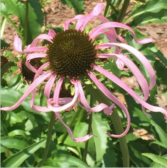
Echinacea laevigata smooth coneflower