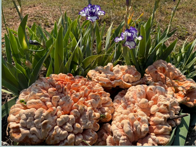
Chicken of the woods