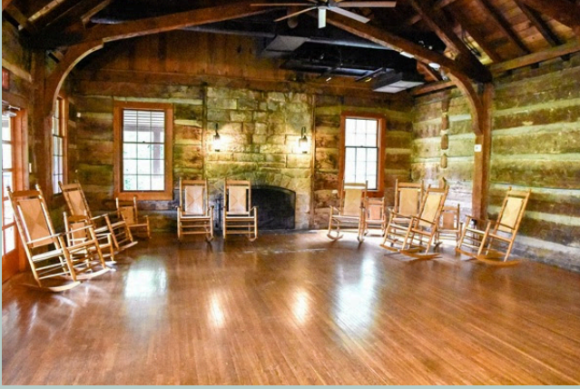
Table Rock lodge