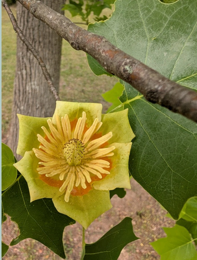
Liriodendron tulipifera , aka Tulip poplar flower.

Not a poplar at all--but a member of the magnolia family.