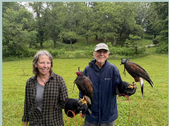
Two very happy people!