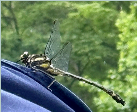
The Dragonhunter