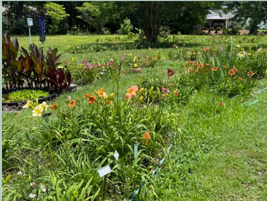
This Month in your Garden hgic.clemson.edu