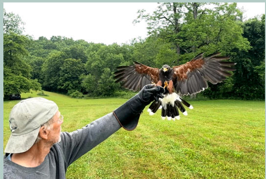
Who's flying high now?