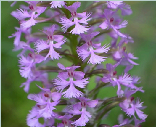
Platanthera psycodes , Lesser purple fringed orchid, Photo by Christopher David Benda

This field trip is an opportunity to view the magnificent purple fringed orchids ( Platanthera psycodes ) with our native plant expert, Dan Whitten, in their summer splendor at Mount Mitchell State Park!