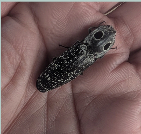
Eastern eyed click beetle