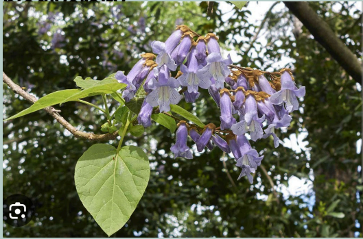
Invasive Paulownia tomentosa, a.k.a. the Princess tree