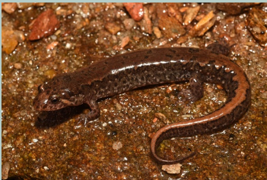
Foothills dusky salamander

the amazing critters that call this mountain stream home.