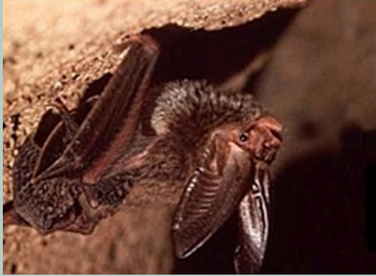
Plecotus rafinesquii Rafinesque's Big-eared bat