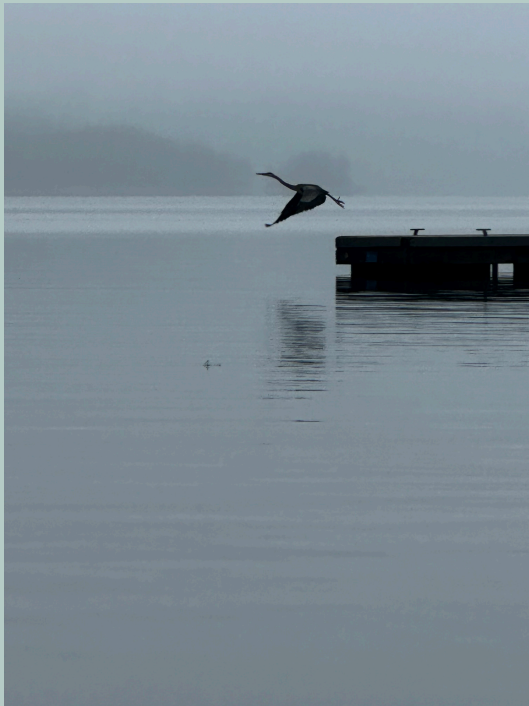
Great blue heron