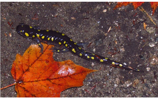
Ambystoma maculatum, Spotted salamander Photo by Cantley, Quebec