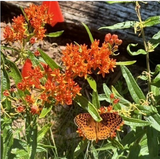
Gulf fritillary on milkweed

On the first Tuesday of each month, join Park Rangers to perform maintenance on the Native Landscape Garden's at the Park's Visitor Center so they continue to serve as a living native plant education opportunity to all who view them.